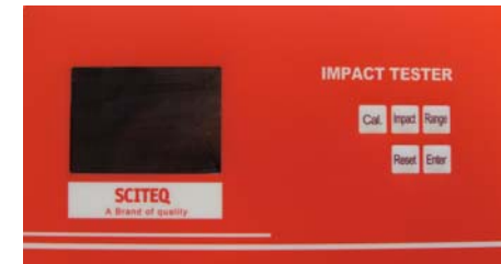
LCD control panel with operating buttons

On the LCD display the absorbed energy in joules after test specimen impact will be shown. Recorded test results can be analysed further via equations specified in the standard.